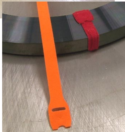
Wagner Coilkeepers come 6 to a pack and securely bind steel rule coils or even strips of steel rule easily - without the use of tools!

Coilkeepers are a unique system of nylon "hook and loop" fasteners especially-designed to keep coils of steel rule securely strapped together. Coilkeepers are easy to use, and when used properly, can be reused for hundreds of wraps. Applying Coilkeepers is quick and easy, and requires no special tools, simply wrap the coil squarely at approximately three spots around the coil at 120° intervals. For best results keep Coilkeepers at least 4 to 6 inches away from coil ends and do not slide across sharp rule edge. Coilkeepers also work great in storing bundles of strip steel rule too!