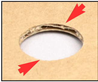
Actual cut with a Wagner Inside-Inside Bevel Serrated Punch. Note the clean edge cut with minimal tearing and board crush.