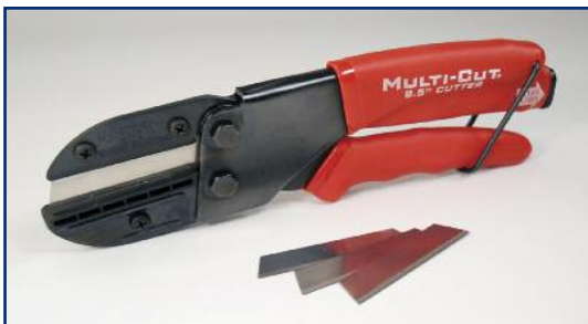
Multi-Cut Pliers - great for cutting any non-metallic matrix or die ejection rubber an economic alternative to high cost cutters! Comes with 4 blades +storage cartridge!

Use Countamax to repair broken phenolic counters - right on the press! Reduce downtime!