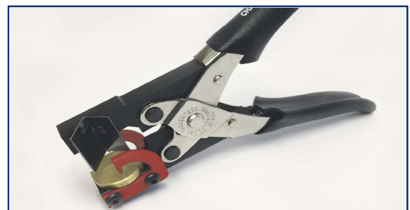
CCM Matrix Miter Pliers - register an exact mitered cut. Blade cuts matrix and finger lift tape. Heavy duty to cut metal-based matrix and precise enough to cut small pieces!