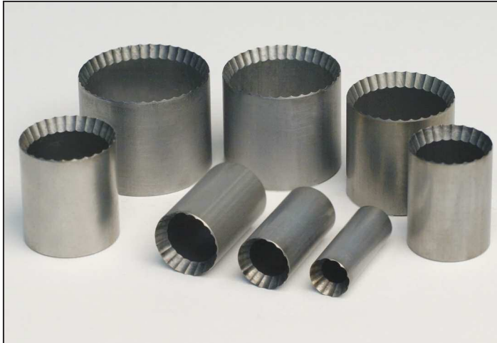
Wagner's exclusive IBIS™ Inside-Bevel Inside-Serrated series of punches cut with less pressure, and require less ejection material than other rotary punches!

Wagner's Inside-Bevel, Inside-Serrated or IBIS™ punches - provide a cleaner cut, with less pressure, reducing board crush and ejects cleanly using less ejection material!