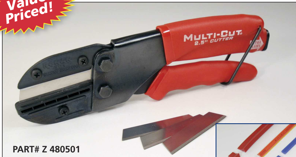
PART# Z 480501

Multi-Cut Pliers from Wagner feature extra-sharp stainless steel blades, and an in-handle storage cartridge for 3 extra blades (included).